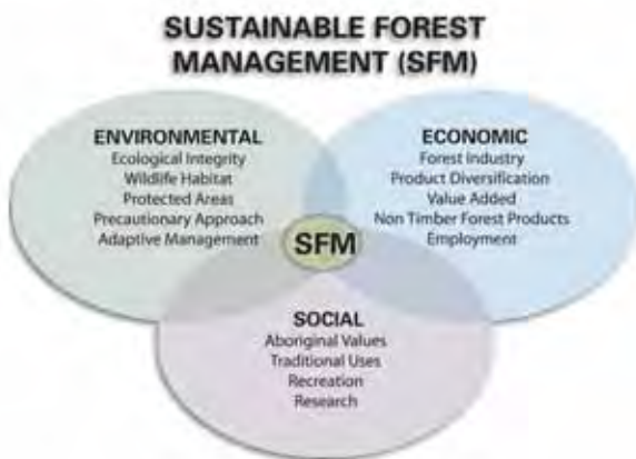
Diagram 1: Sustainable Forest Management

In response to the growing concern surrounding forest sustainability the concept of forest certification arose. The idea was to develop a process for certifying forest management practices to a pre-determined set of standards which define sustainable forest management. Independent third party auditors evaluate forest operations to assess whether owners and/or managers meet the required standards. Forest certification ensures that forest owners, practitioners, and operators comply with established and accepted management standards. It provides assurance to forest owners, managers, operators, consumers, and the local community that the production of wood products from a certified land base does not damage the overall health of the forest, the stability of the ecosystems, or the livelihoods of local communities. Forest certification is a voluntary, market-based concept, that lets purchasers – and everyone along the supply chain – choose to support sound forest practices.